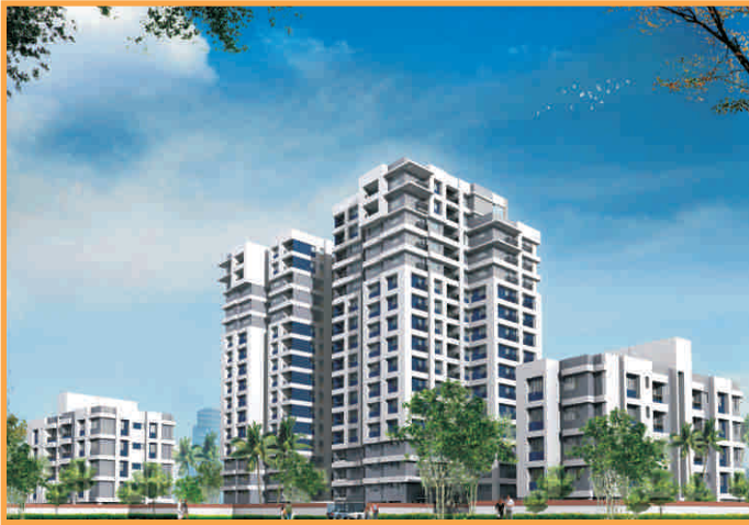
Rohra Heights, G+16 hi-rise at New Town