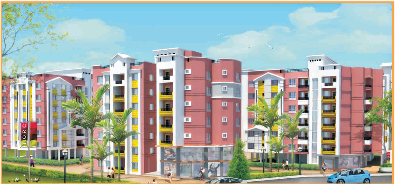
Tirath Project, 133 flats luxurious complex at Rajarhat