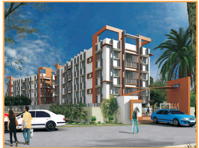
Radhey Krishna Residency at Beliaghata