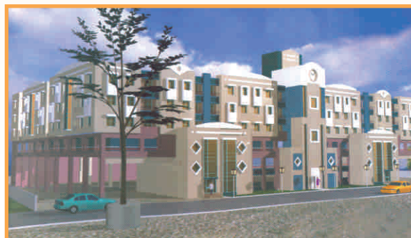
Rohra Plaza, Hooghly