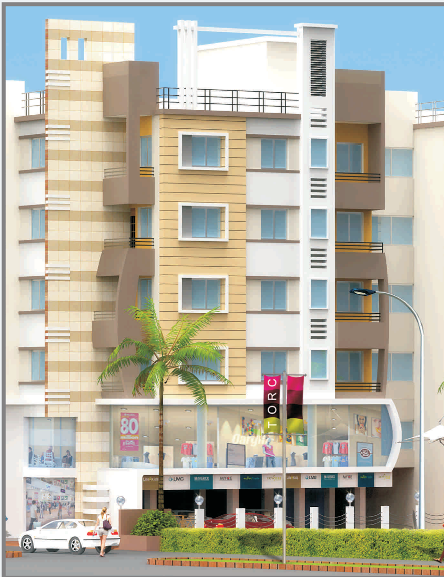
On Rajarhat Main Road, Dashadrone Bus Stand