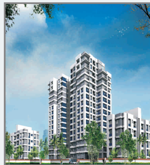
Rohra Heights, G+16 hi-rise at New Town