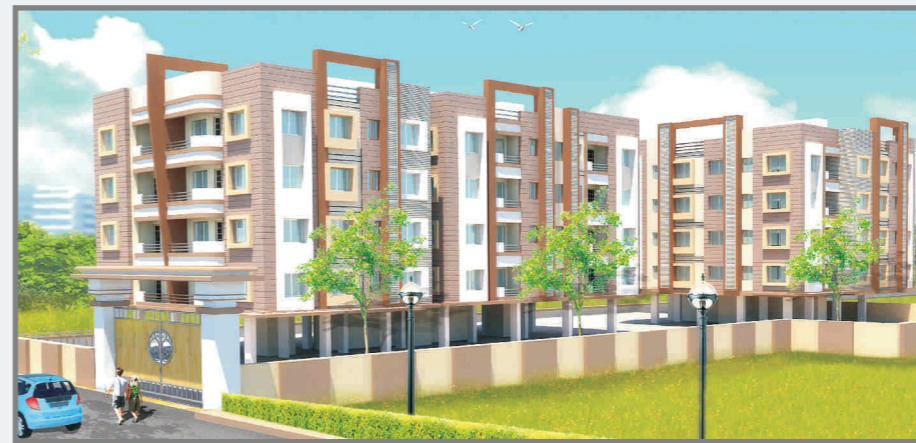
Tirath Project, Phase II, A G+4 abode