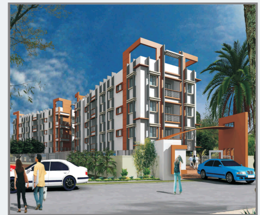
Radhey Krishna Residency, at Beliaghata