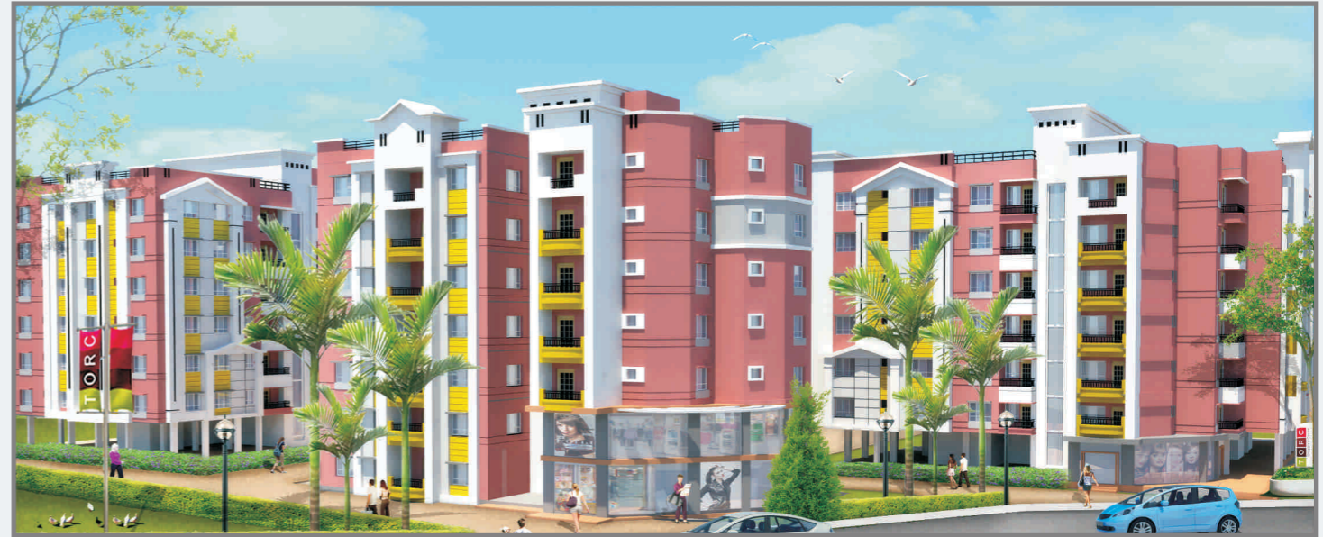
Tirath Project, 133 flats luxurious complex at Rajarhat