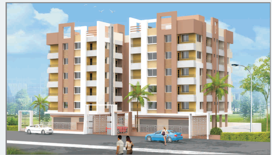
Tirath Residency, Near Salua More, Rajarhat