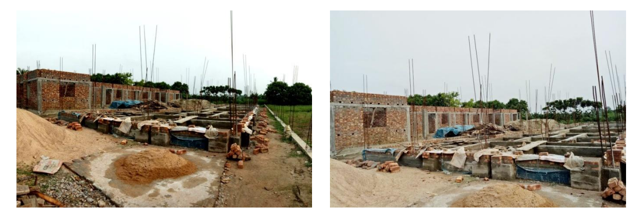
Building of Chandpur Azizia Girls Academy (Girls Hostel) under construction

3) Chandpur Azizia Girls Academy (Girls Hostel) : The Governing Body of the Organization have decided in the General Meeting that a separate Girls Institute Namely Chandpur Azizia Girls Academy is constructing this year which was promoted last year poses 200 beds. This Academy will follow the syllabus of West Bengal Board of secondary Education. This Academy will poses class-V to X(Ten) level.