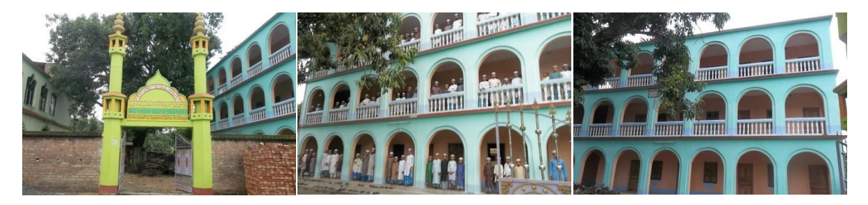
Building's of Chandpur Nooria Siddiquia Madrasah

2)Chandpur Nooria Siddiquia Madrasah : Our organization maintain under a sub-committee to this Residential Religious educational Institution since last 10 years. About 150 residential poor, neglected and orphan students have gotten the Religious education with general education up to class VIII(Eight level) including fooding, loading and treatment facility. Our target of this project that to make higher up and proper care the Poor neglected orphan children from our target areas.